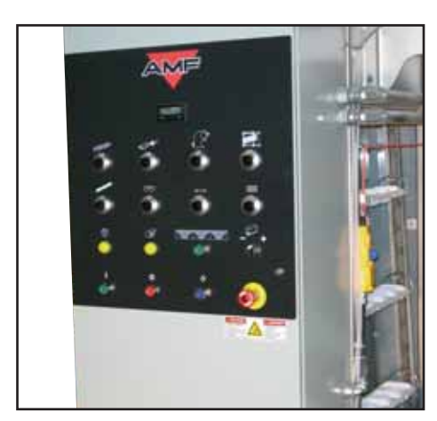
User-Friendly Operator Controls